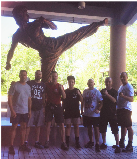
Bruce Lee Museum

In between sessions we took some time out to visit some of the highlights such as the Bruce Lee Museum, the Ten Thousand Buddhas Temple, Bruce Lee’s childhood home and the Giant Buddha on Lantau Island and its surrounding temples at the local villages.