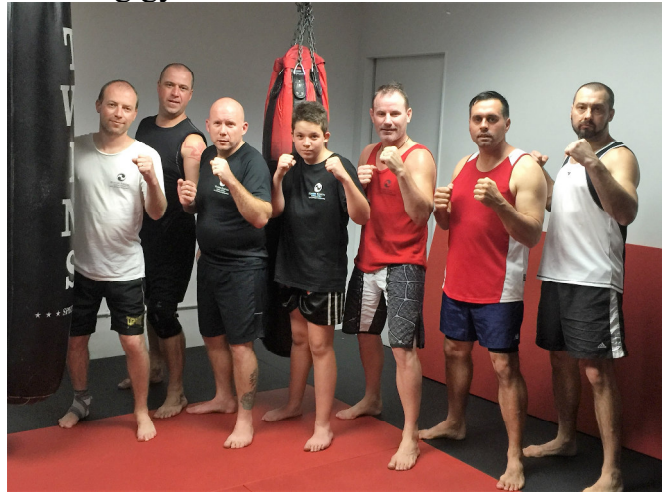
Training at DEF Boxing

In between sessions we took some time out to visit some of the highlights such as the Bruce Lee Museum, the Ten Thousand Buddhas Temple, Bruce Lee’s childhood home and the Giant Buddha on Lantau Island and its surrounding temples at the local villages.